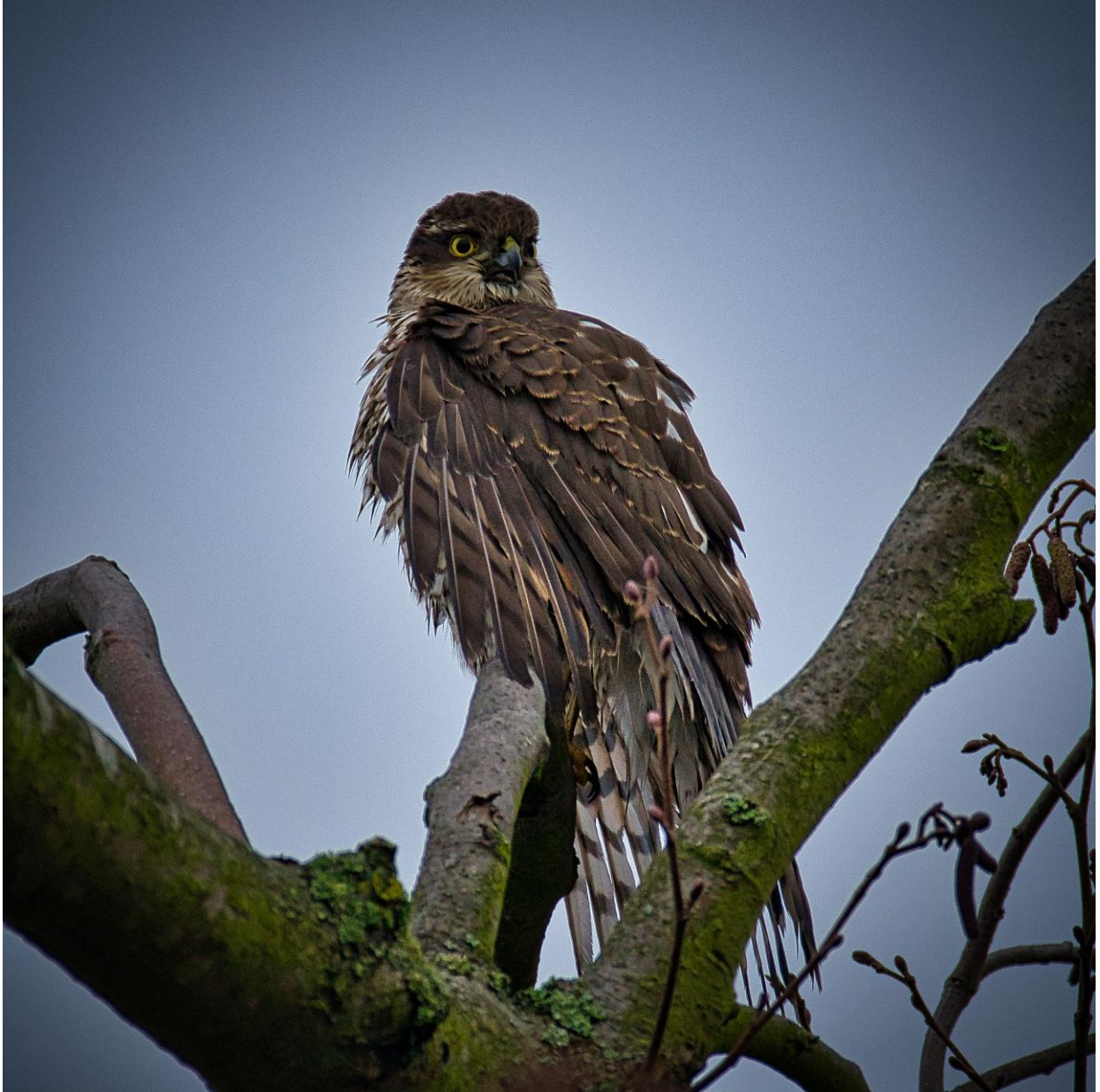
Sparrow hawk at London Wetlands Centre