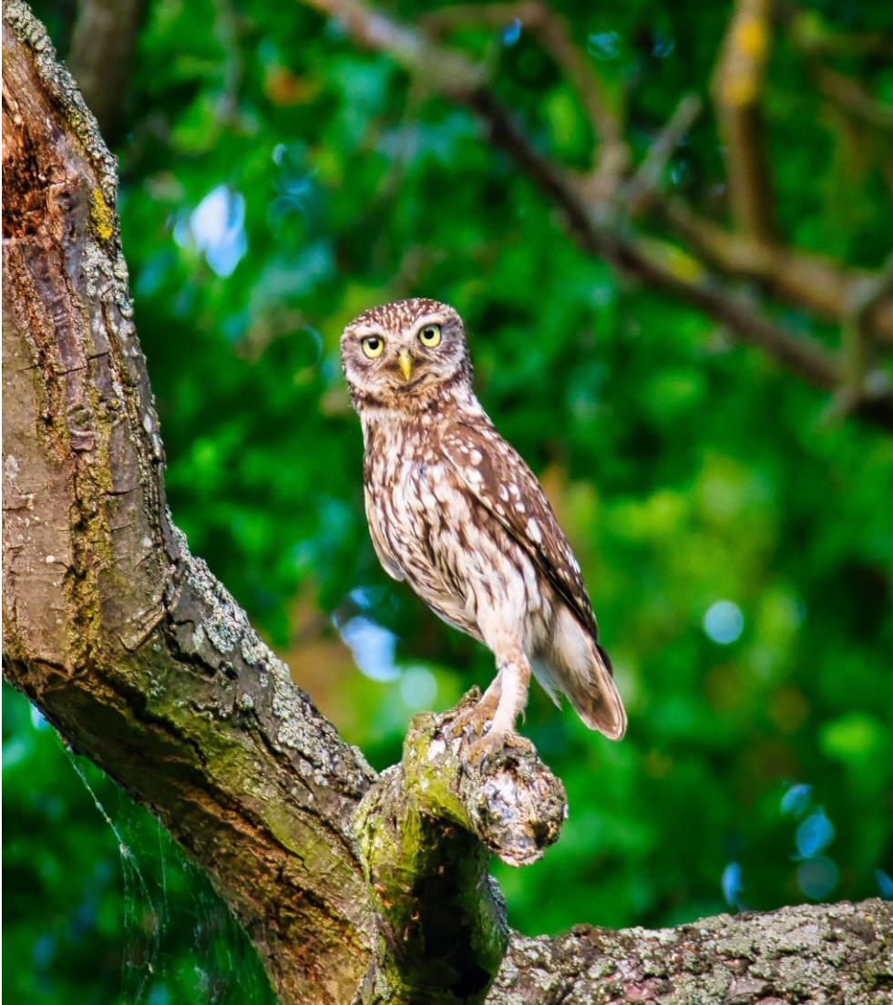
Spotted in Bushey Park

The Monthly Magazine of London Road, Ewell and Tolworth United Reformed Churches