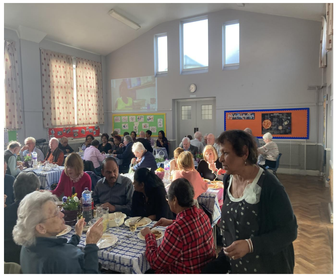
Curry night at Tolworth!

The Monthly Magazine of London Road, Ewell and Tolworth United Reformed Churches